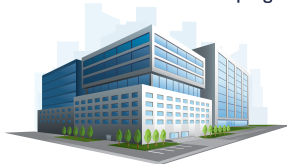
Figure 4 DHCS administers the Medi-Cal program ...

... but it incorrectly believes that it does not have authority to recruit additional Medi-Cal providers in underserved areas .