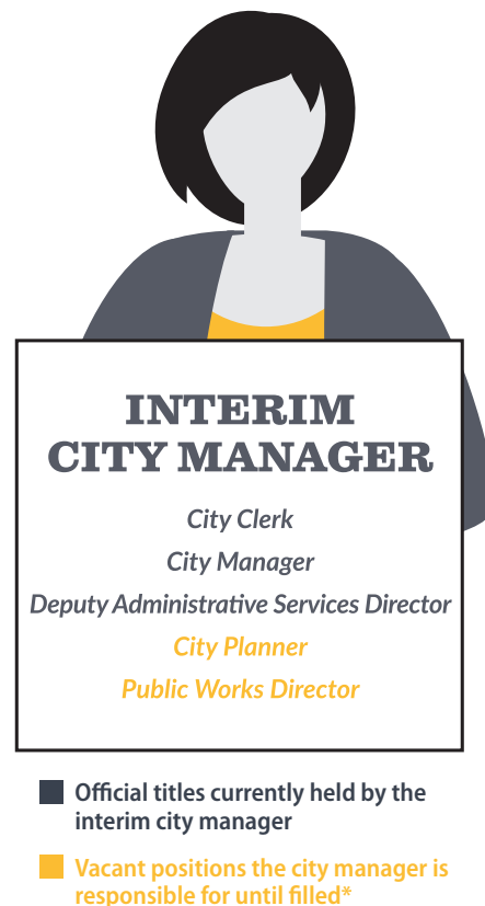
Figure 3 Blythe’s Interim City Manager Holds Numerous Positions and Responsibilities

Source: City personnel records, organization charts, staff directory, city municipal code, and interviews with city management.