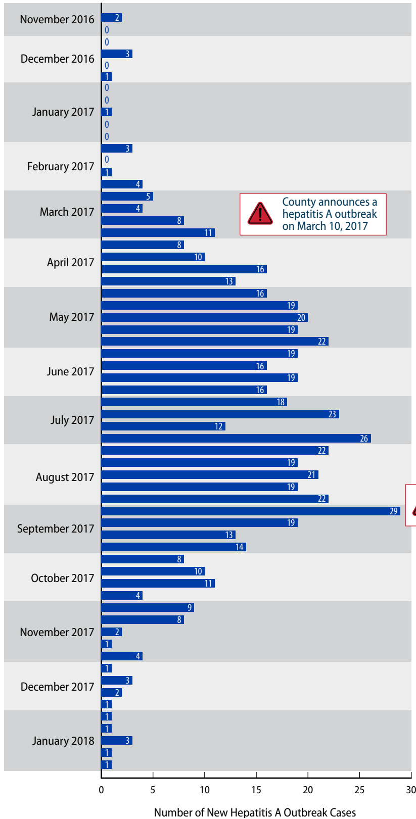
Figure 1 The Number of New Hepatitis A Outbreak Cases Each Week Did Not Start Steadily Decreasing Until September 2017