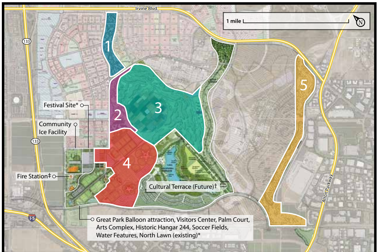
Figure 1 Current and Planned Development of Orange County Great Park

that contractors provided and the contract’s requirements for insurance. It also detected about $4,000 in overpayments to the Great Park Design Studio. According to the review, the city received reimbursement for the overpayments.