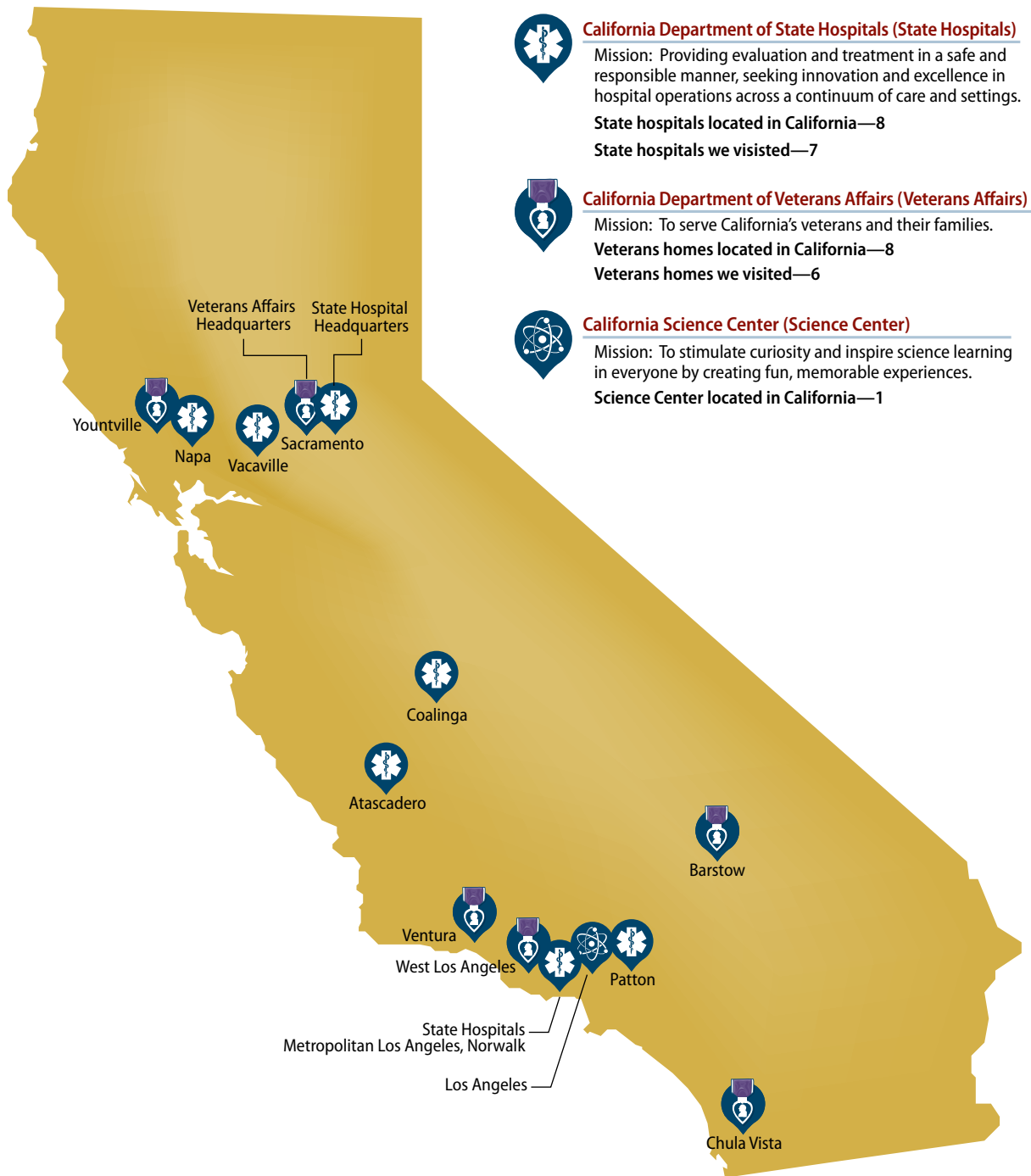
Figure 1 Locations We Visited During This Review