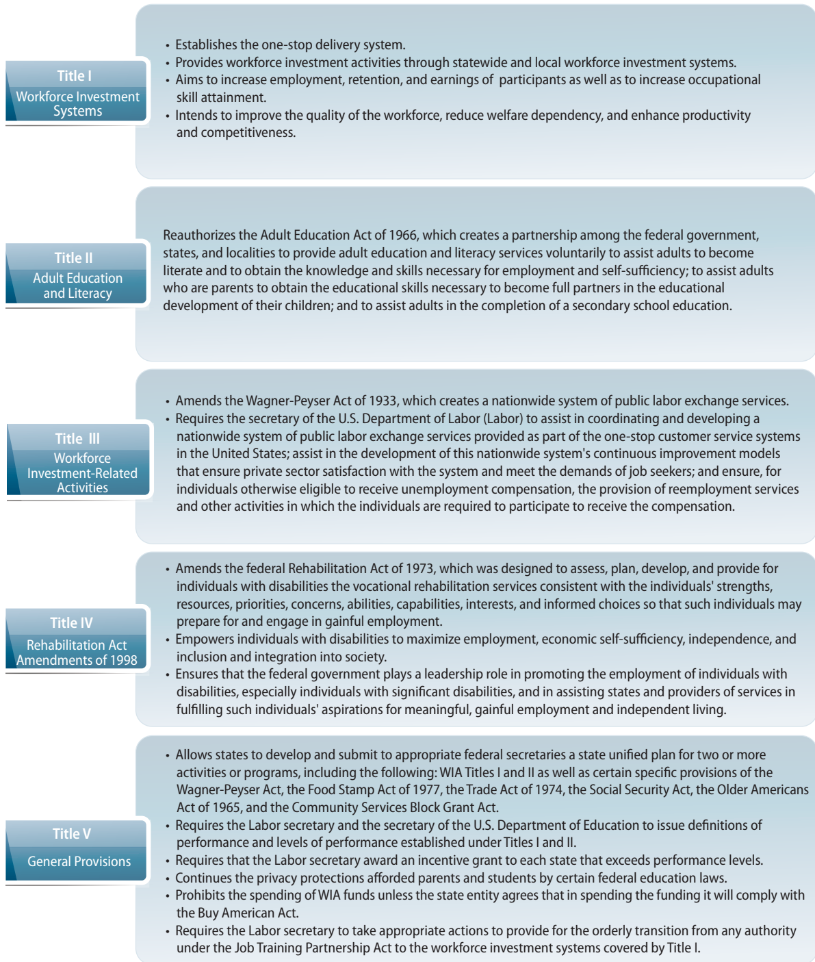
Figure 1 Purpose of the Five Titles That Compose the Federal Workforce Investment Act of 1998

Sources: The federal Workforce Investment Act of 1998 (Public Law 105-220); and the Web sites for Labor, the California Department of Education, and the California Department of Rehabilitation.