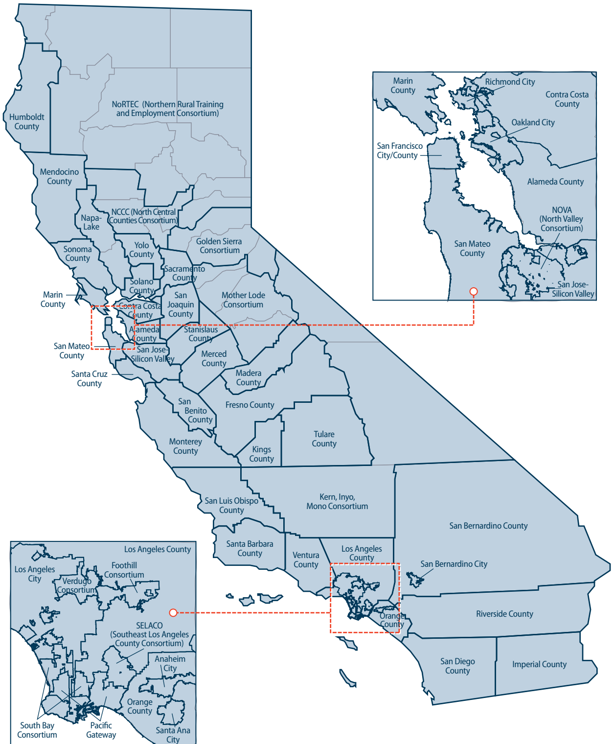
Figure 2 Map of California's 49 Local Workforce Investment Areas as of July 1, 2011

Source: Employment Development Department.