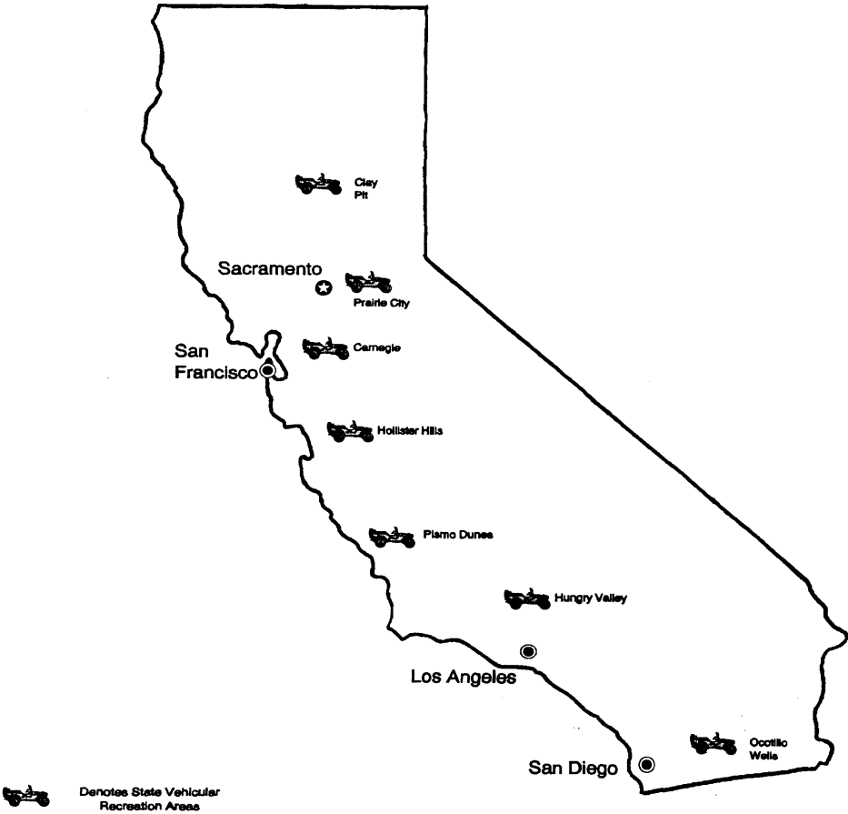
Chart State Vehicular Recreation Areas

consist of approximately 55,600 acres located throughout the State as shown on the following chart. The department estimates that more than 1.3 million visitors used these facilities during fiscal year 1988-89.